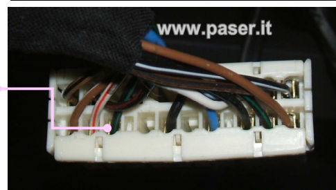
CONNESSIONI DI LOGICAN LOGICAN CONNECTIONS