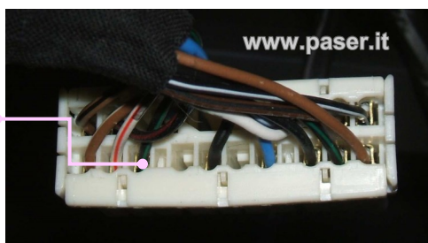
CONNESSIONI DI UNICO DUAL UNICO DUAL CONNECTIONS