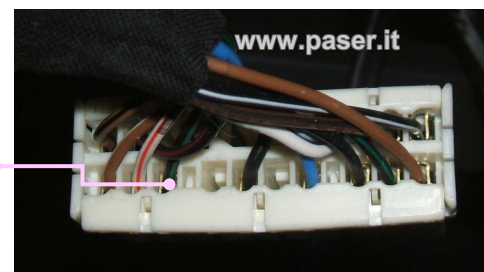
CONNESSIONI DI UNICOM UNICOM CONNECTIONS

BEHIND THE CAR RADIO THERE IS THE OEM RADIO CONNECTOR. PLEASE CONNECT PINK WIRE OF THE MODULE TO THE GREEN/BLACK WIRE (POS. 16).