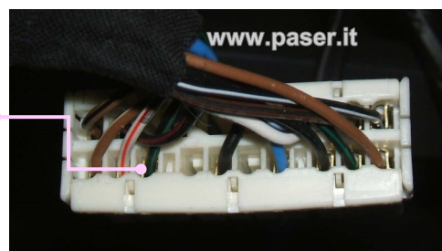
CONNESSIONI DI LOGICAN LOGICAN CONNECTIONS