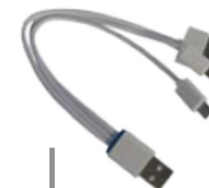
ADAPTER USB/IPOD (LIGHTNING E30 PIN) MICROUSB