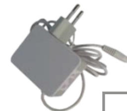
HARNESS TO CONNECTING TO 220V